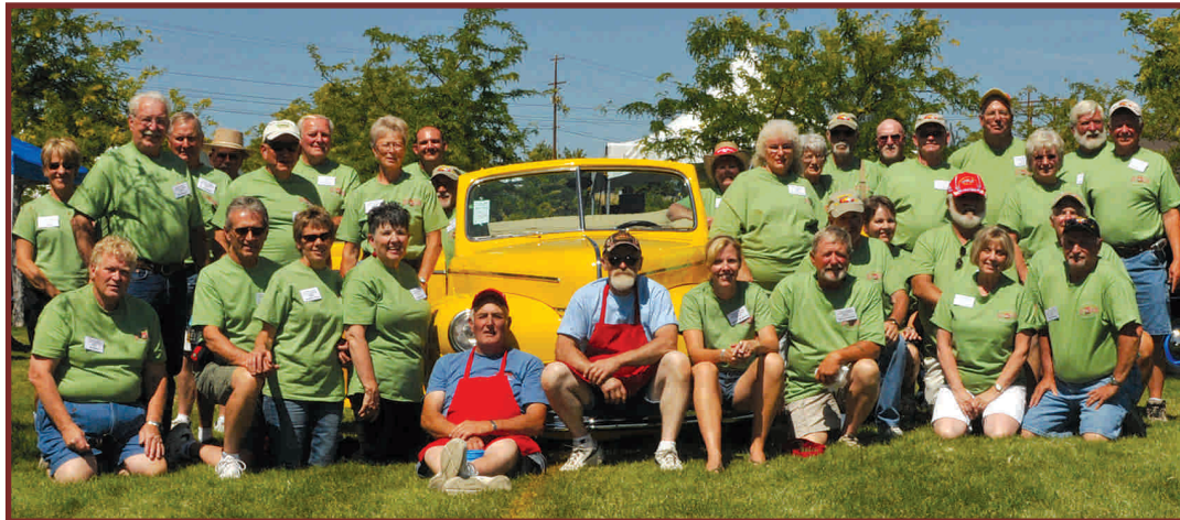
Members of the Wenatchee Valley Street Rod club at the 2009 Apple Run

All proceeds from the Apple Run benefit Central Washington Hospital.